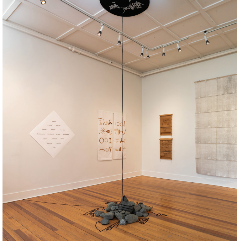
two sisters Stones, fleece, thread, chloroplast, 2026 Dimensions variable