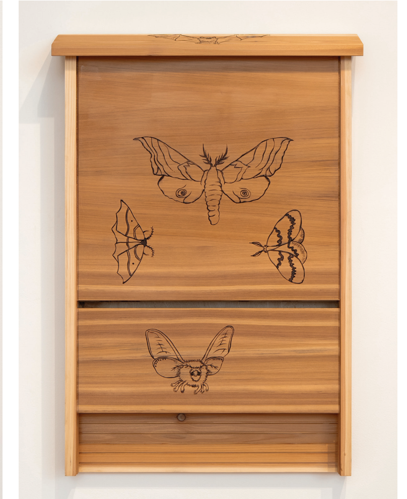
Houses for Bats Two bat houses built with salvaged cedar by Kenton Doupe, pyrographic drawing by Jim Holyoak, 2026 29"x 18"x 2" each