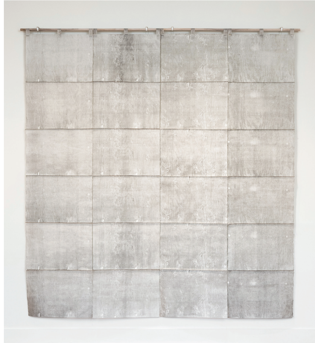
Old-Growth Forest Meditation Relief prints: foraged charcoal, starched Japanese paper, waxed linen thread, 2026 112"x105"