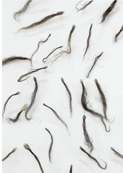
Little Swimmers Old Man's Beard, beeswax, 2025 Dimensions variable 6'x6'