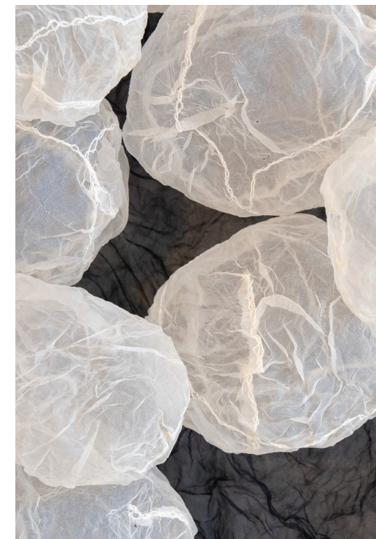
Seeing Through Stone Silk organza, thread, 2025 30"x 30"x 10"